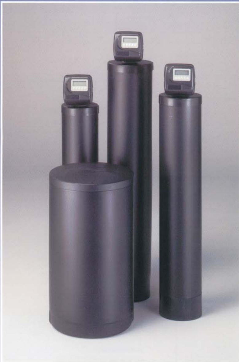
Windsor Series shown in 24,000, 32,000, and 48,000 capacities with optional tank jackets.

Experience the benefits of soft water with the efficiency of The Windsor Series